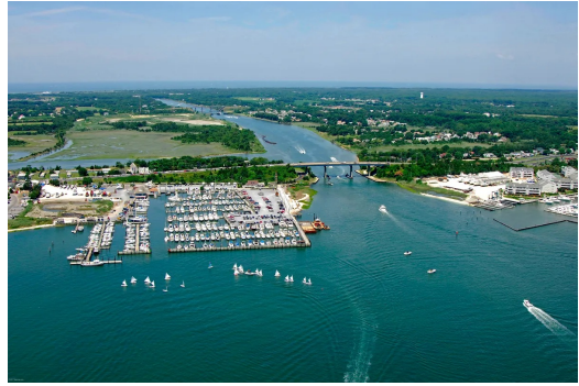
Cape May Canal being used in the modern day.