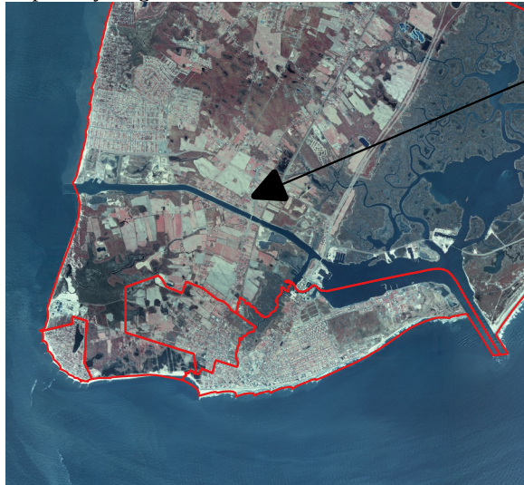
Cape May Region in the 1980s