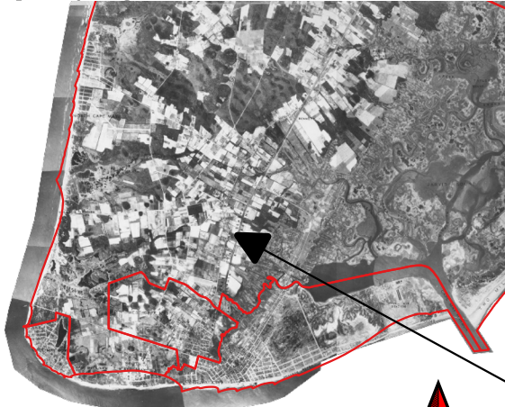
Cape May Region in the 1930s

Note the cropped coastal region in the 1930s imagery.